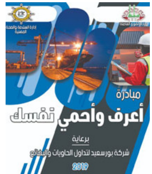
"Know and protect yourself"