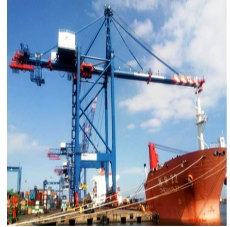
Delivery of new STS

On Sunday 11/2/2019, PSCCHC received giant gantry crane, manufactured by the Chinese company (ZPMC). PSCT (Port Said Container terminal) took delivery of (1) Ship-To-Shore "ZPMC" Super Post Panamax gantry crane 65 tons with 58.5 meter outreach and width 22 stacks of double full containers with an investment cost 8 million and 806 thousand Dollars. This step comes to face the strong competition between container terminals in the maritime transport market, by developing handling equipment system to increase PSCT competitiveness as well as dealing with new generations of containers vessels, especially after the comprehensive development plans which was carried out during the previous two years by increasing the depth of the quay berth to allow receiving vessels with 15.5m draft & length up to 370m to turn in front of West Port Said container quay & exit to the sea as well as increasing yard area to be 572000 square meters. WPSCT is moving ahead with development plans and achievements in order to raise the company's position in maritime market, hoping further progress and development for PSCCHC.